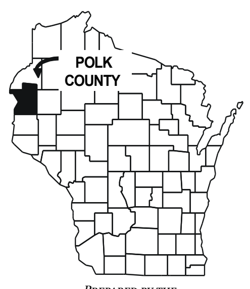
PREPARED BY THE WEST CENTRAL WISCONSIN REGIONAL PLANNING COMMISSION

Source: 2020 Census; 2022 American Community Survey 5-Year Estimates; Wisconsin DOA Population Projections, 2013