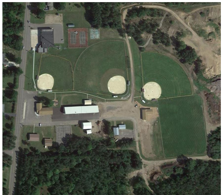
MPA Geography 101 Answer: This photo is in the Town of Lafayette. The Town Hall, Town Garage, and Town Park are in the photo. Here is a link to the web map.

How good is your geography in the MPA? We will continue to show a different aerial photo of the MPA, and you can try and see if you know where it is located.